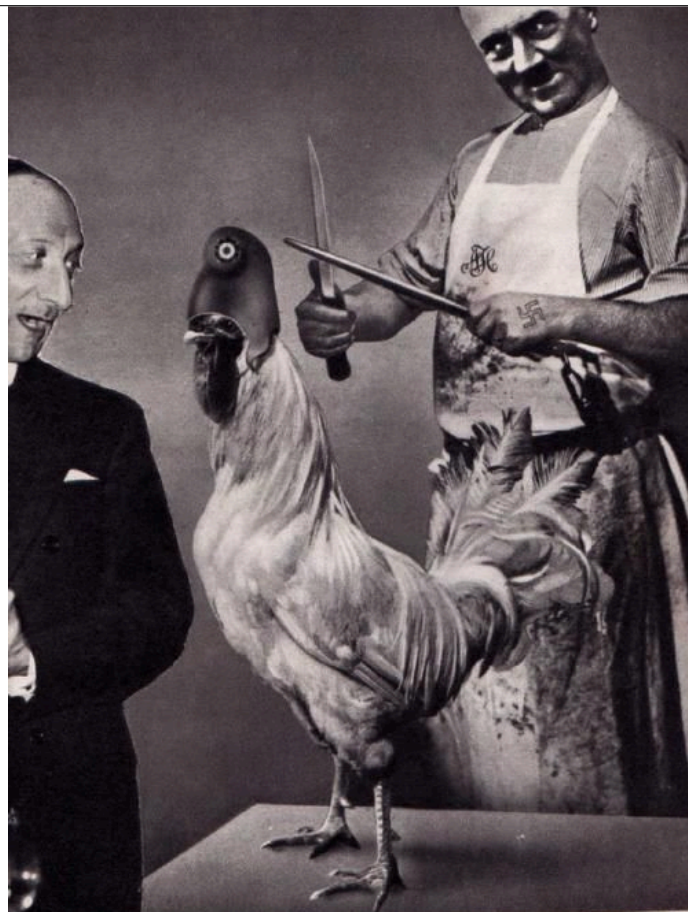
Which German artists risked his life with these anti-Nazi posters?