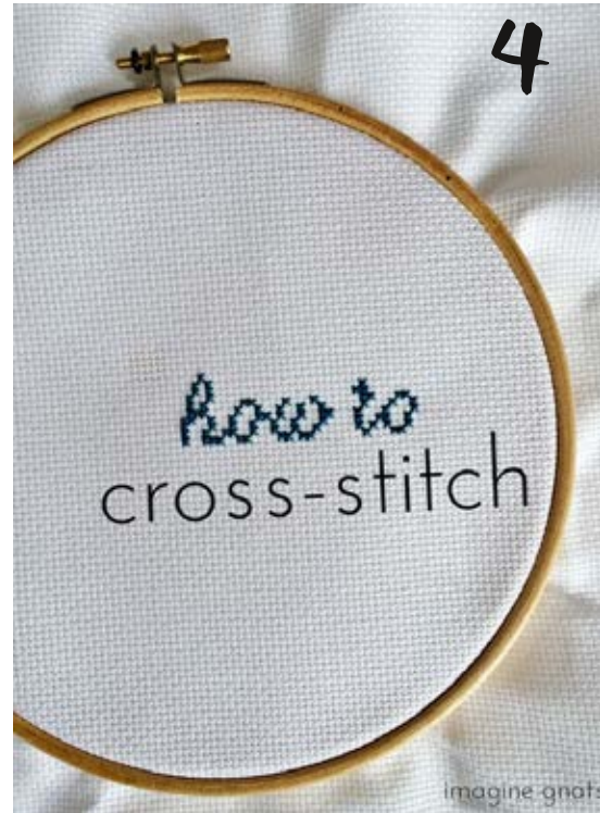
A definitive guide