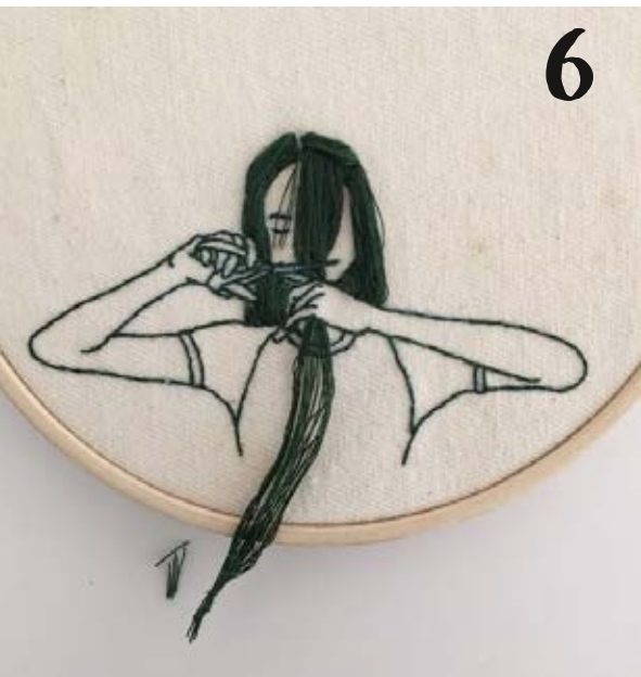
Interview with Sheena Laim