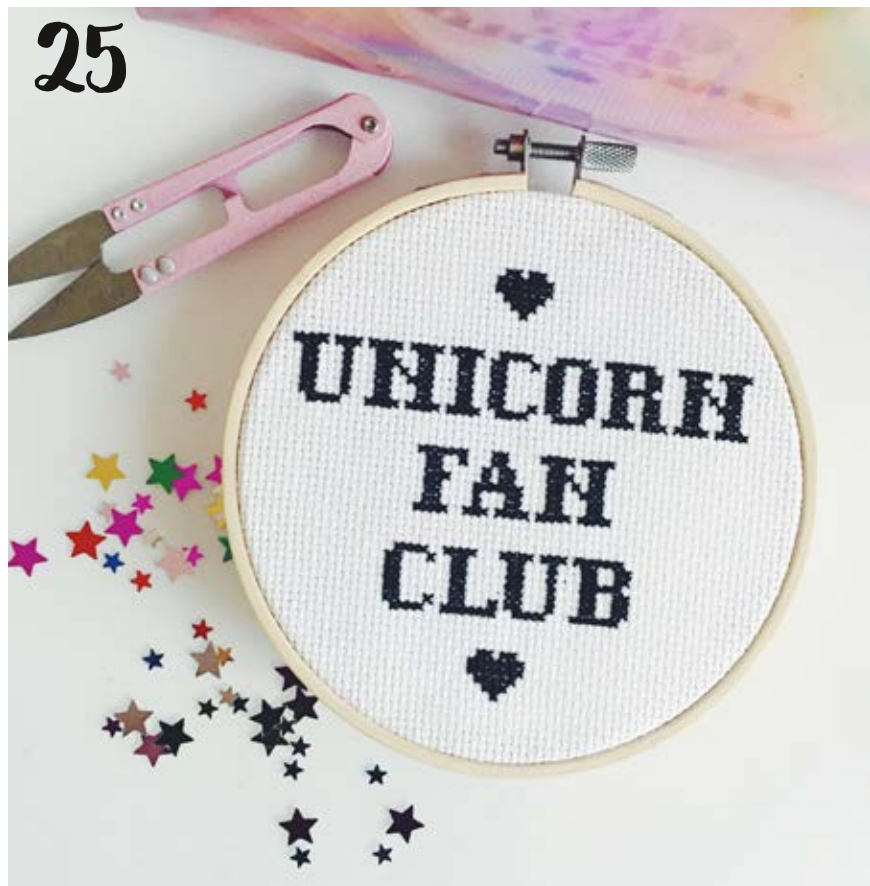
Free Pattern Inside